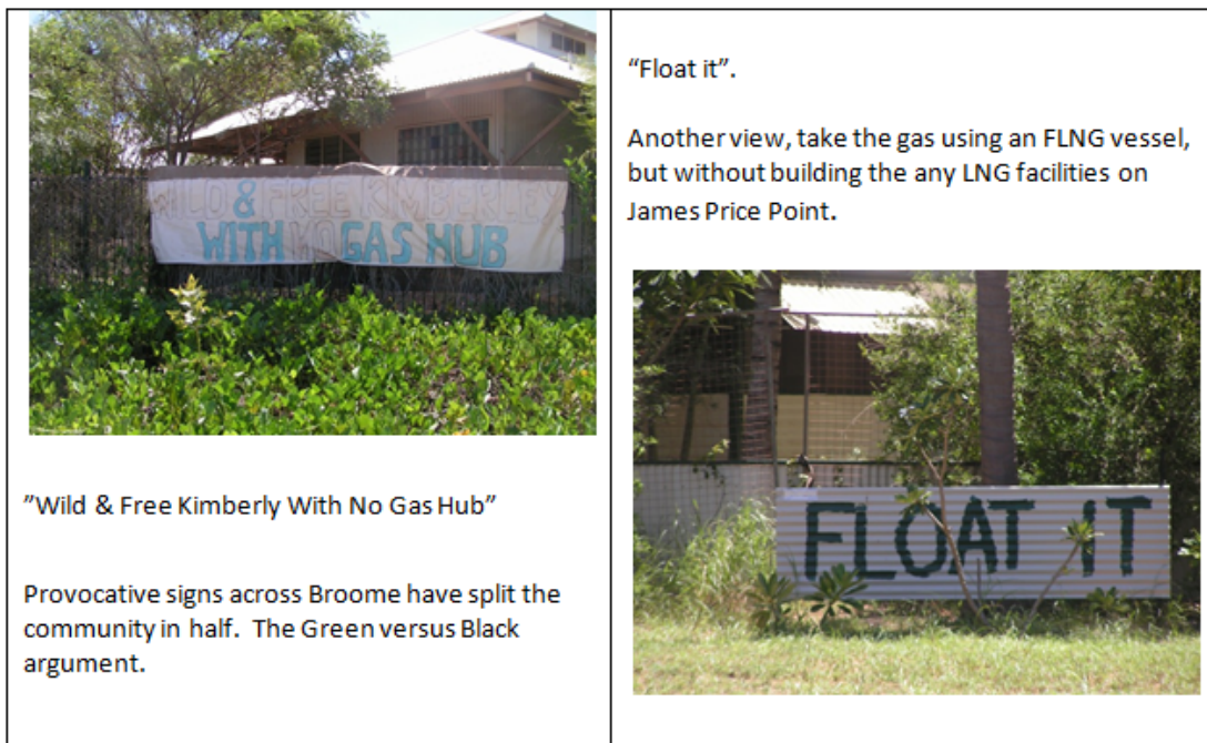
Figure 5. Photographs taken in February 2012, of Broome environmental activism, with a display of disagreement between protesters.

Aboriginal leaders in Kimberley and Cape York say green groups have a determination to maintain “wilderness” areas distant from the comfortable suburbs in which most of their supporters live. By doing so they are depriving indigenous people of the economic opportunities they need to end poverty and social marginalization (Barras & Taylor, 2011). In response some green groups have accused Aboriginal people supportive of major resource projects of selling out their culture and the environment for short-term financial gains. The Kimberley Land Council (KLC) defended the vote that approved its deal with Woodside in which fewer than 300 Goolarabooloo Jabirr Jabirr people voted and 168 said yes. A point of contention was that some voters were under 18, though the National Native Title Tribunal under the rules of the Native Title Act monitored the ballot and should have excluded such voters.