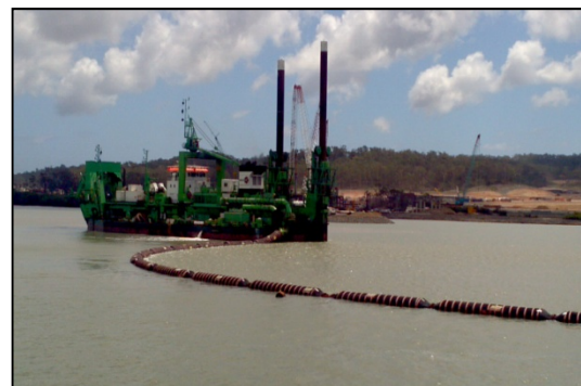
Figure 3. Photographs of activity on Curtis Island, in the Gladstone harbor vicinity taken in January 2012 and November 2011, respectively.

As yet, there is no agreement in place to build a bridge from the mainland out to Curtis Island. For the duration of construction, and possibly into future operations, it is expected that the connections will be maintained by Ferry & Barges