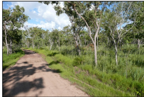
Figure 2. Photographs taken in February 2012 on Blaydin Point, Northern Territory. The area identified for the Ichthys INPEX LNG Facility.

This is the location where the LNG shipping berth is to be built. It is currently used by locals for fishing.